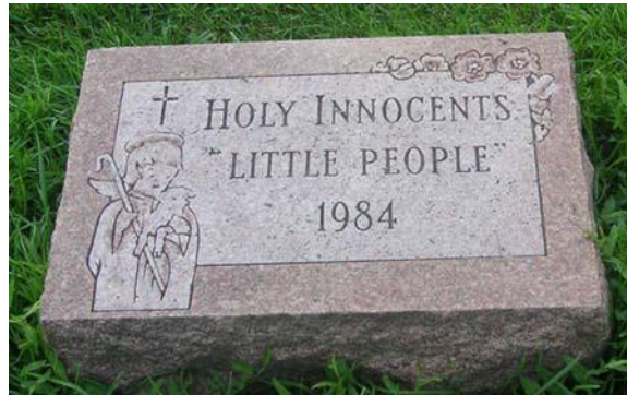
“Little People” gravestone